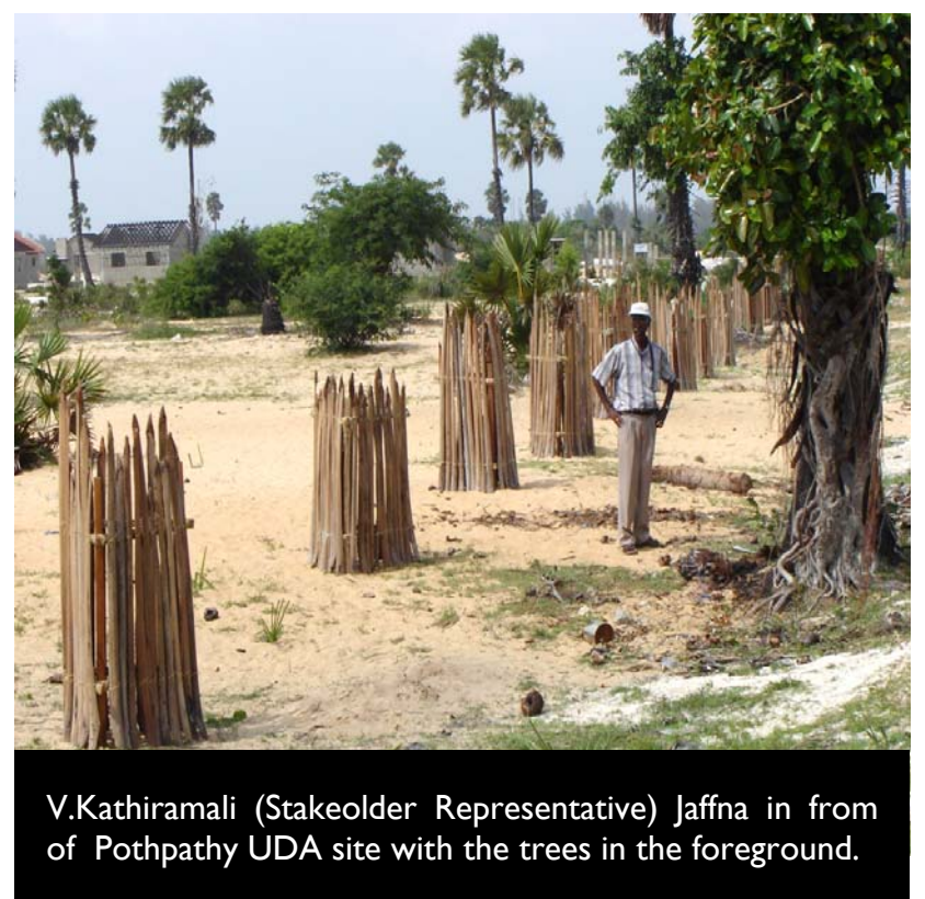
V.Kathiramali (Stakeholder Representative) Jaffna in from of Pothpathy UDA site with the trees in the foreground.